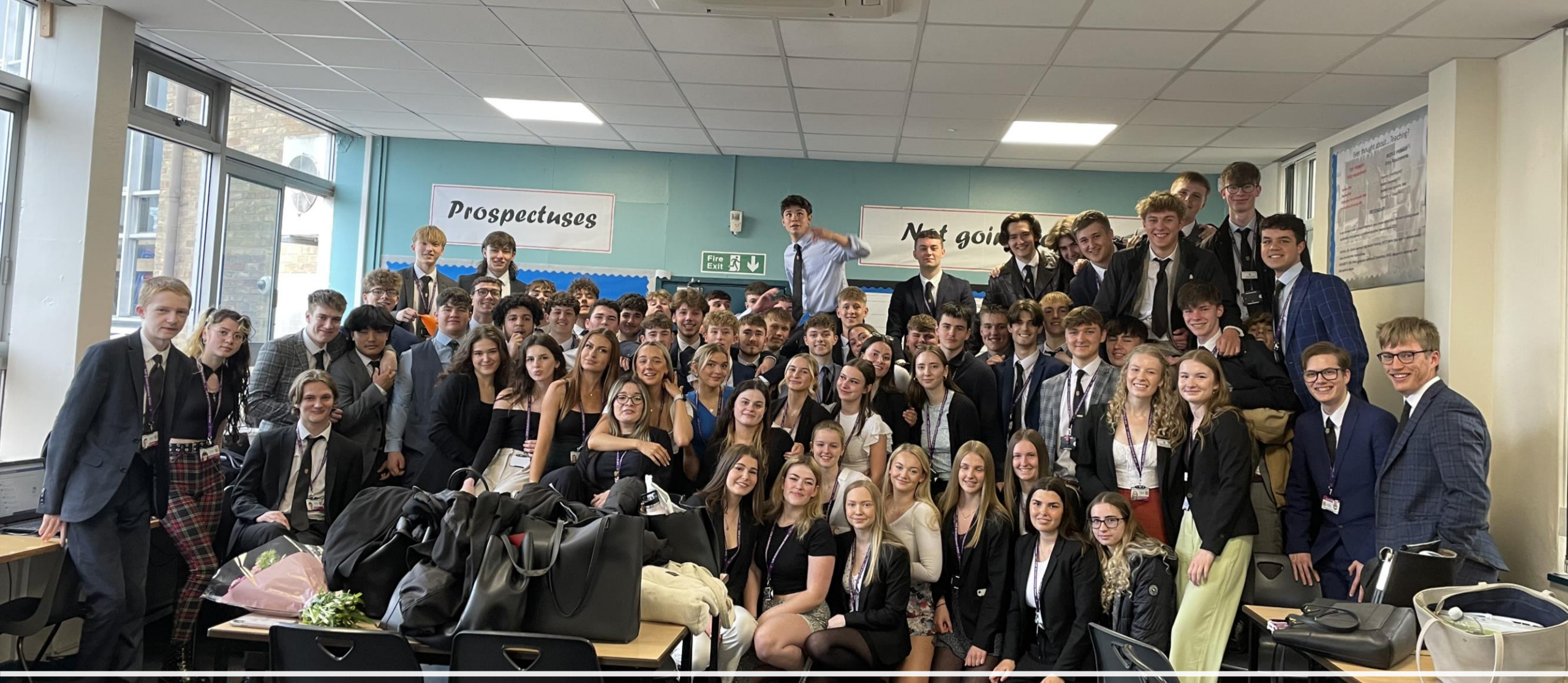
Year 13 Leavers' (Summer 2022)